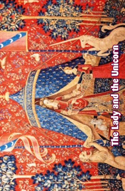
The Lady and the Unicorn